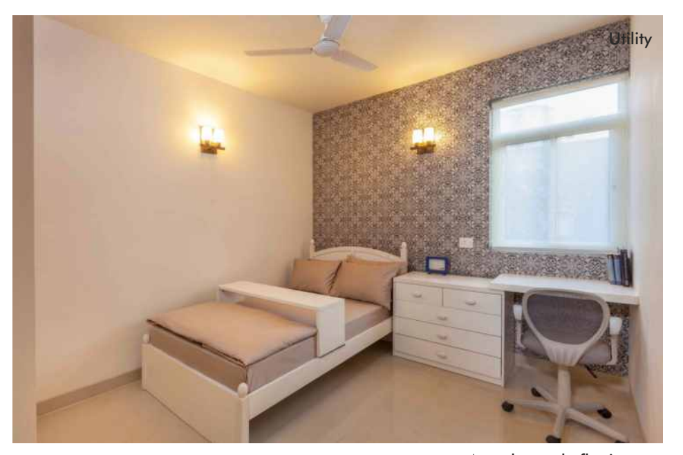
Actual sample flat images