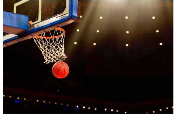
*All images are an artistic conceptualization and do not purport to replicate the exact product.