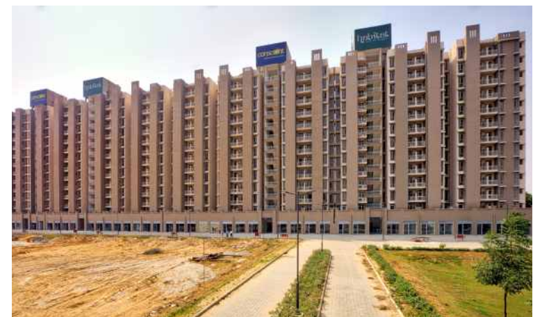
Actual Site Images