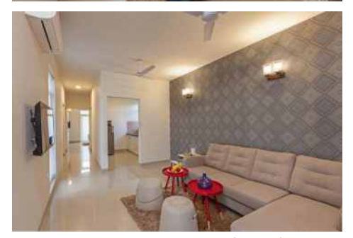
Actual Sample Images