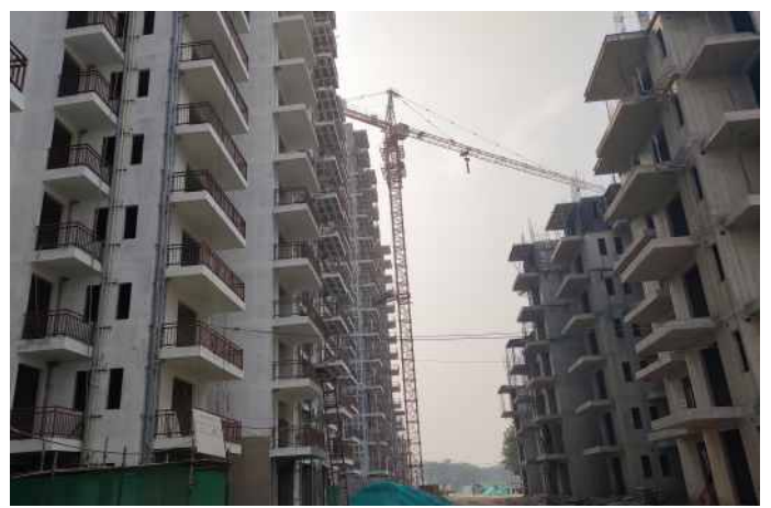
Actual Site Images